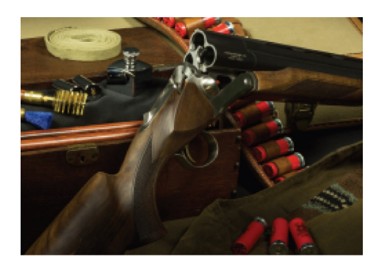
The massive breech of Chiappa's threebarrel shotguns is made in Turkey by AKKAR

Chiappa's "Triple Crown" and "Triple Threat" shotguns are basically built around a conventional break-open mechanism that's typical of all over-and-under and side-by-side shotguns, albeit of course scaled up for the dimensions of the massive breech and three barrels overall. Both models feature a standard manual safety crest, a standard opening lever, and a single trigger. Opening the breech requires quite some energy, it's hard and heavy, but it's necessary as the opening movement also automatically arms the three internal strikers of the gun – providing such a system with external